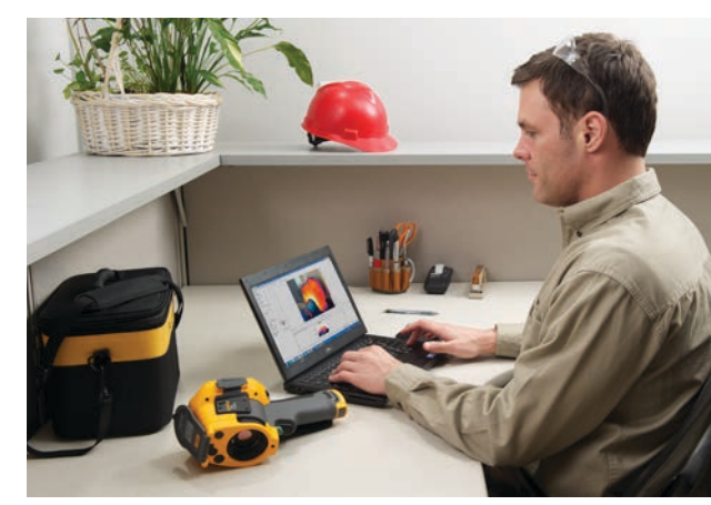
Description: Optimize, view, analyze and create customizable reports with SmartView® Software.

In summary, there are a number of reasons why you should add temperature inspections to your building and/or maintenance inspection checklist. Most importantly, thermal imaging surveys can save you a lot of time and effort in locating existing and potential problems, which can jeopardize not only building performance, but also compliance with building, health and safety regulations.