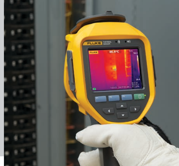
Get high quality images within seconds with LaserSharp ^{\mbox{\tiny TM}} Auto Focus.

By pinpointing potential sources of problems, you also save valuable inspection time and repair only what needs to be fixed, rather than performing repairs regardless of actual need. Repeated temperature measurements of the same targets can determine whether repairs were successful and help anticipate future repairs.