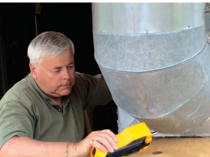
Test both return and conditioned ducts for contaminants, indicating leaks or other system malfunctions.

You've probably heard mold referred to as the "new asbestos" for HVAC/R. Concern about mold and its health effects is driving consumers to have their indoor air quality (IAQ) situation assessed and, if necessary, repaired.