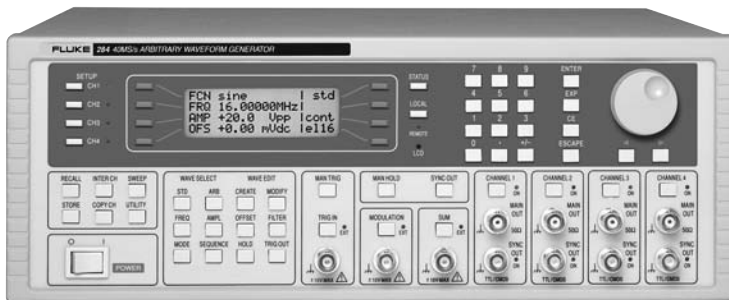
284 Waveform Generator

These universal waveform generators combine many generators in one instrument. Their extensive signal simulation capabilities include arbitrary waveforms, function generator, pulse/pulse train generator, sweep generator, trigger generator, tone generator, and amplitude modulation source.