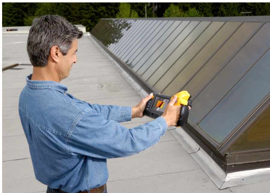
Facilities manager checks the roof flashing to make sure there is no moisture penetration.

Windows, doors construction joints, wall and roof penetrations. Look for thermal anomalies and air flow differences that indicate heat loss or gain through the building envelope. The same strategies used to enhance indoor and outdoor temperature differences for checking walls may be used to help identify heating or cooling losses through windows, doors, construction joints and building envelope penetrations. In addition, for relatively small structures or areas of a building that can be isolated, consider using a blower to pressurize the building or area. This will make more apparent the egress of air of a different temperature.