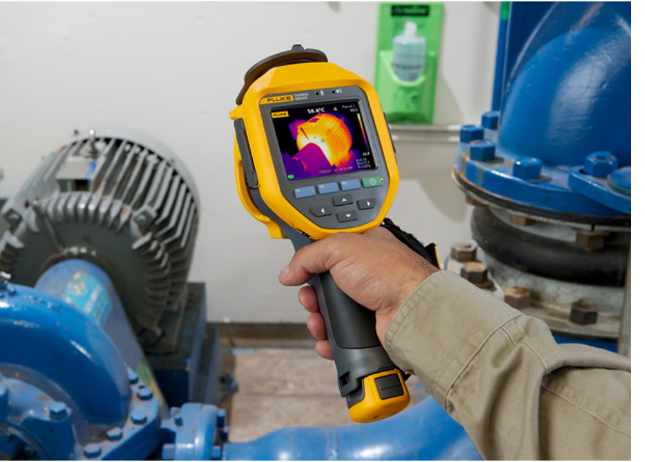
Take a baseline image of all motors, to compare over time, and then routinely look for abnormal hot spots on the motor, under full load.

Note: While thermal imaging is non-contact, if you measure live electricity with the enclosure doors removed, NFAP 70E safety standards still apply. Wear appropriate personal protective equipment, try to stay four feet away from the object, and minimize time spent in the arc-flash zone.