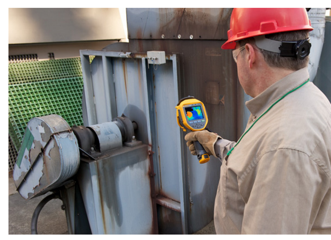
Shafts made of shiny stainless steel can be tricky to measure with thermal cameras. Compensate by measuring close to the coupling.

While most large process tanks have built-in visual or electronic indicators for tracking product levels, they are not always reliable. Thermal inspections can reveal the interface between the liquid and the gas (usually air) in a vessel, indicating how full it is and whether the contents have settled or separated inappropriately. Knowing the correct levels avoids overfilling when a level sensor is faulty and ensures reliable inventory figures for raw materials and/or finished products.