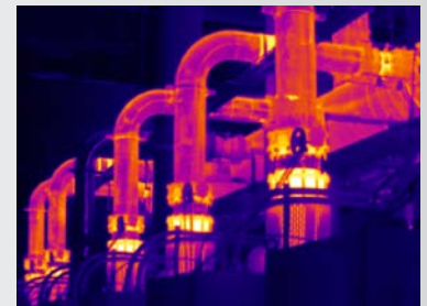
MultiSharp™ Focus produces an image focused throughout the field of view