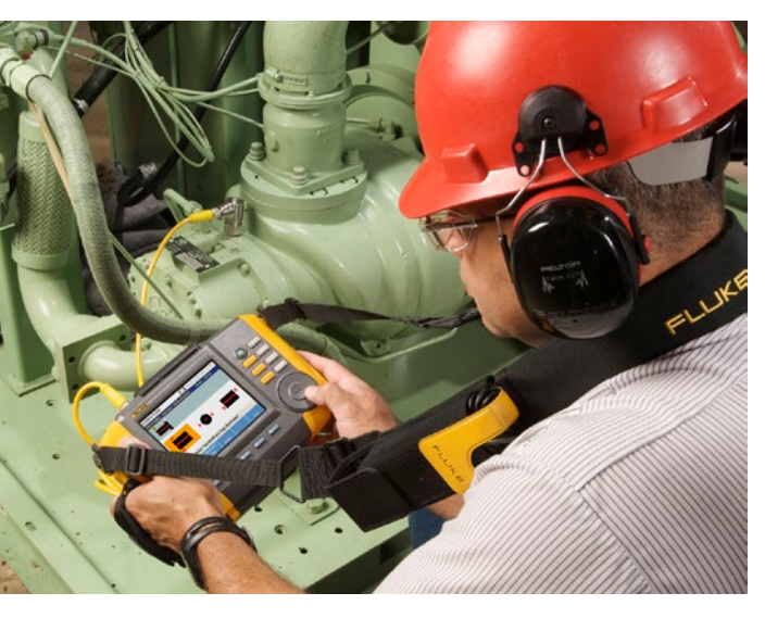
The award-winning Fluke 810 Vibration Meter uses an auto-diagnostic program that helps workers stay efficient.

Vibration analysis is critical to a condition-based maintenance program, and a welcome alternative to run-to-fail strategies used by many plants. Vibration analysis allows you to measure machine health and find faults without taking machines offline, and to schedule repairs only when needed. This way, repairs are not performed prematurely or behind schedule. A new wave of vibration technology includes rules (automated vibration fault patterns) and algorithms programmed into analyzers to diagnose problems.