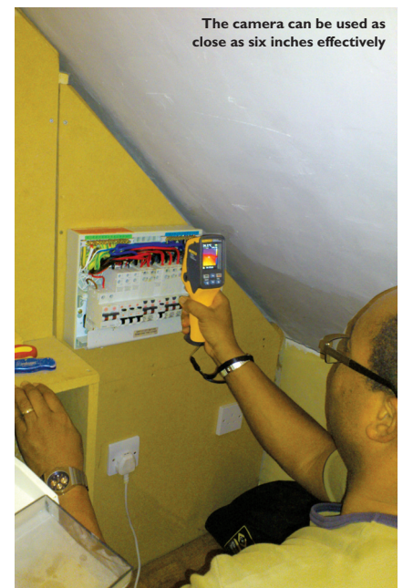
The camera can be used as close as six inches effectively

Even without reading through the entire manual you get a very good idea of what it can do. Thermal Imaging is a growing field as insurance companies have started to request these types of surveys particularly where access to carry out insulation resistance or continuity tests is virtually impossible. While Thermal imaging should never replace traditional testing, it does give you a measure of flexibility and another string to your bow, so... point & shoot!